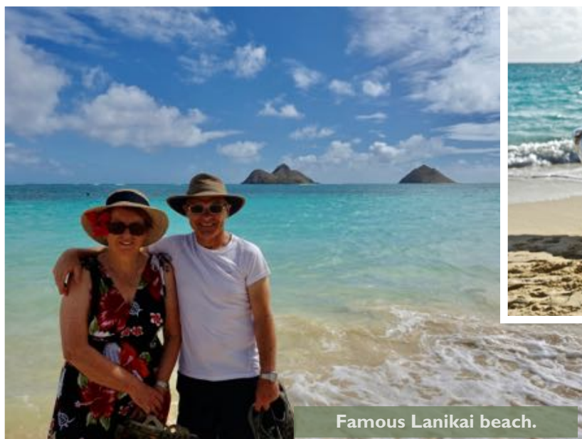
Famous Lanikai beach.