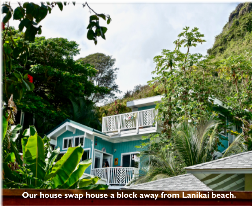
Our house swap house a block away from Lanikai beach.

Today we had a lazy breakfast, a short walk on the beach and then, after lunch, a leisurely drive in the fun little two seater car to the southern part of the island. It is relatively undeveloped. At numerous points we parked our car and took in the ambience. We even took a longer walk up to a high point overlooking the sea with the islands in the background. We stopped at a great beach. The waves were really dumping right onto the beach. Lovely day.