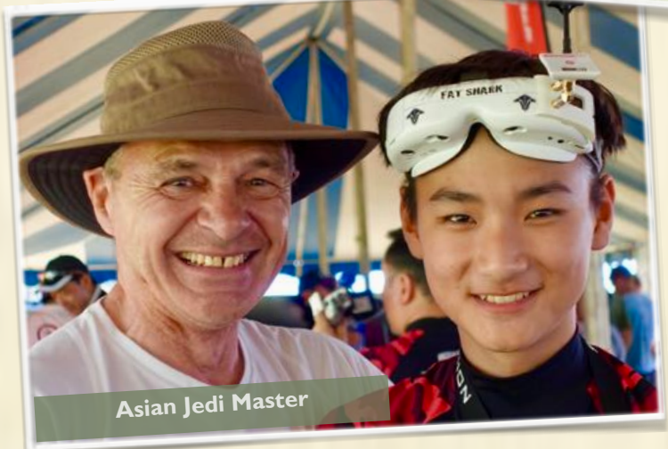
Asian Jedi Master