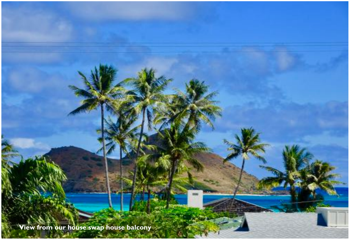
View from our house swap house balcony